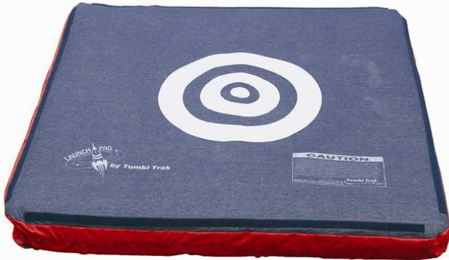
4'x4'x5" Launch Pad

Remember those old jogger tramps for drills? Here's a newer, better product that's lighter and easier to use! The Launch Pad is a thicker, bouncier, and more powerful version of the Sweet Spot. With its 5" high base, and 4' x 4' square size the Launch Pad is a great portable training device for young tumblers or vaulters. It's useful in a wide variety of drills and progressions. It can help with round-offs, handsprings, back tucks, standing fulls, front saltos, and vaulting forward and backwards. A strong denim cover with a target design and non-skid material on the bottom comes with the Launch Pad. The bottom also includes loops for easy strapping to other equipment (straps included). A Micro Ramp is a good partner for this piece.