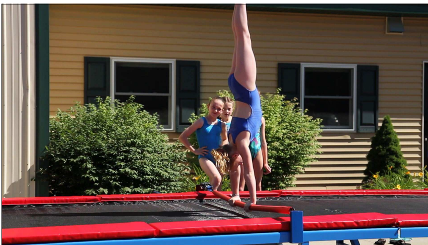
Bounce to handstand