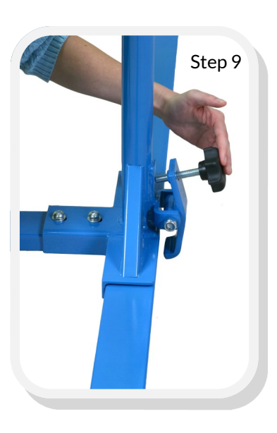
Step 9- Lift and push the knob against the upright then place the unit on the side leg. Release the knob and allow the bottom lip to fit securely under the side leg. Repeat for the other side of the upright & bar assembly. NOTE: You may have to unscrew the knob slightly to allow clearance.