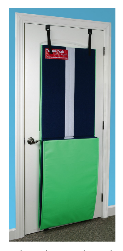
When the Handstand Homework Mat is not in use it can be left on the door and be out of the way!

Fold up the section of the mat that is on the floor and secure it to the carpet with the Velcro tabs.