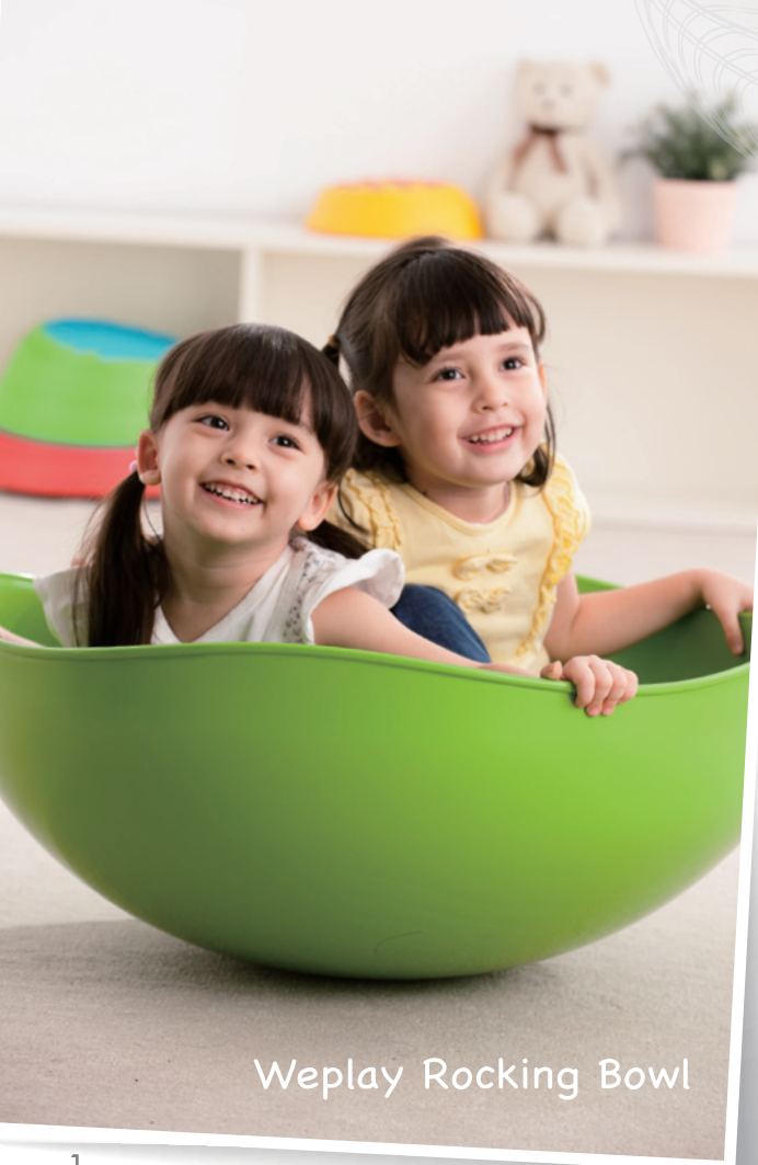
Weplay Rocking Bowl