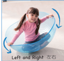
Left and Right 左右