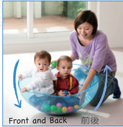
Front and Back 前後