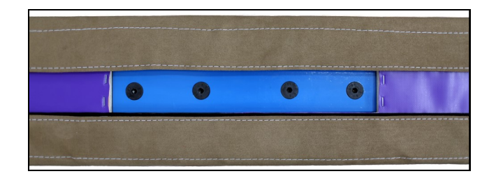
Step 7: Secure them by fully covering the Velcro attached to the beam pieces.

Ensure all sections of the Velcro flaps, including both end sections are fully secured to the beam pieces. Once reviewed use two people to flip over the beam, with one on each end of the Laser Beam Pro.