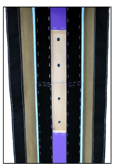
Step 3: Lay a connecter plate over the cut-outs in the beam pieces.