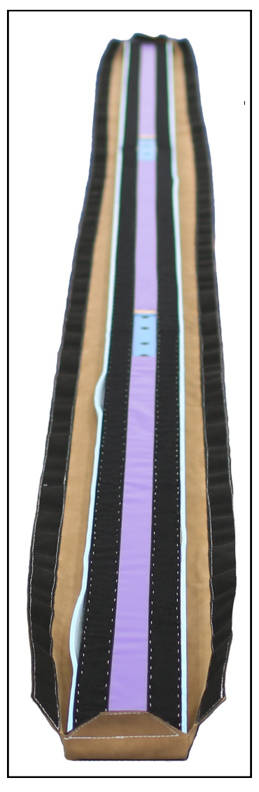
Step 6: On one end start pulling the Velcro flap up and onto the Laser Beam Pro. Line up the seams on the flap with the seams on the beam to fully cover the Velcro.