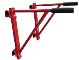
DIP STATION STALL BAR ATTACHMENT