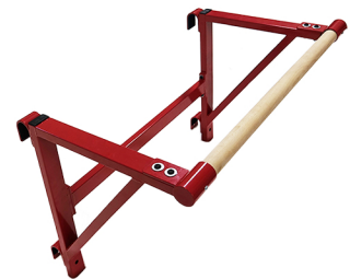
PULL UP STATION STALL BAR ATTACHMENT

Any variation in these measurements will result in the Tumbl Trak Attachments not fitting perfectly.