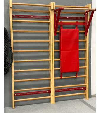
(2) Tumbl Trak Performance Stall Bars (shown with Pull Up Attachment)